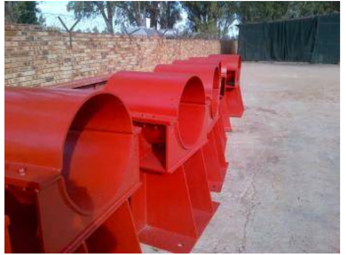
36 X BOXFRONT CHUTES – HARMONY KUSASALETHU SHAFT: