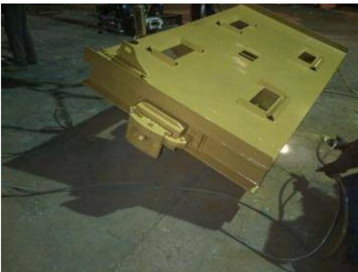
MANUFACTURE INCLINE MATERIAL CAR: