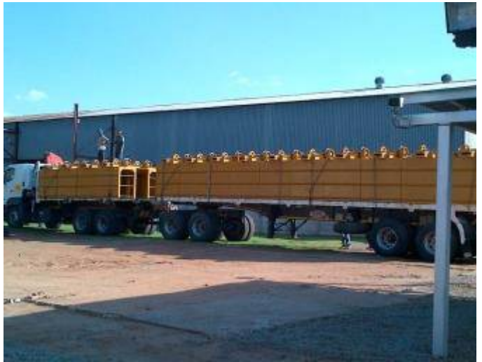
REPAIRED ROLLEMATIC HOPPERS: